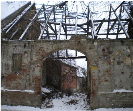
Home in Vukovar Croatia, destroyed in 1991 during the Croatian War of Independence (photo taken 2011)

Conflict is ubiquitous in human interaction. However, when conflict between communities becomes violent, the result can be widespread destruction and loss of