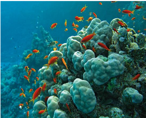
A complex ecosystem: corals reefs in the Red Sea

Practitioners working in the field of Conflict Transformation need to be able to deal with complex conflict situations and to work with many different groups at all levels of society. The process is full of uncertainty and unpredictability, with no guaranteed outcomes. As there is a limit to what any one organization can achieve, each has to determine how best to apply their resources and capacities to bring about an improvement.